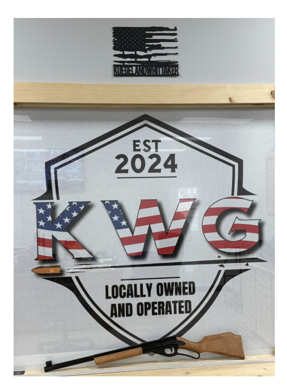
Special thanks from the Daviess County 4-H Marksmen goes to USAdebusk and KWG Guns for helping us get 10 new BB rifles.