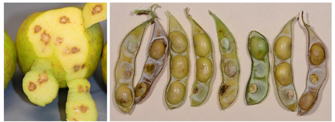
Stink bugs damage many crops, including apples and soybeans

Stink bugs lay their eggs outdoors on the underside of host plant leaves. The newly emerged nymphs are reddish and black in color, becoming brown as they mature. The telltale white and dark banding on legs and antennae of adults is also apparent on the nymphs. Average development time from egg to adult is about 30-45 days. One to two generations per year occur in northern and Midwestern states, while additional generations are possible further south. BMSB adults are quite mobile. They readily fly from one landscape to another and between agricultural, urban and forested areas in search of preferred host plants. These environments also afford overwintering habitat crucial for their survival.