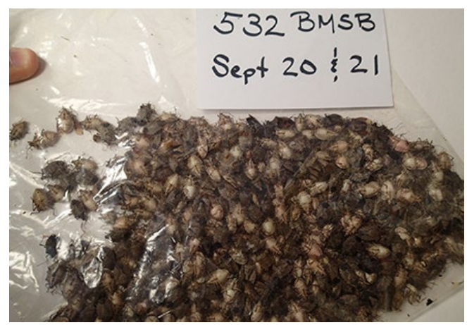
More than 500 stink bugs collected over two days from a home

Buildings in poor repair with many cracks and openings are most vulnerable to infestation. In such cases, stink bugs may enter by the thousands. Overwintering locations include crevices, walls, ceilings, and attics affording cool, dry refuge. Unheated attics are often the most crucial overwintering location inside buildings; crawlspaces and basements are much less preferred. Stink bugs also overwinter in garages, outbuildings, vehicles, HVAC units, gas grills, etc.