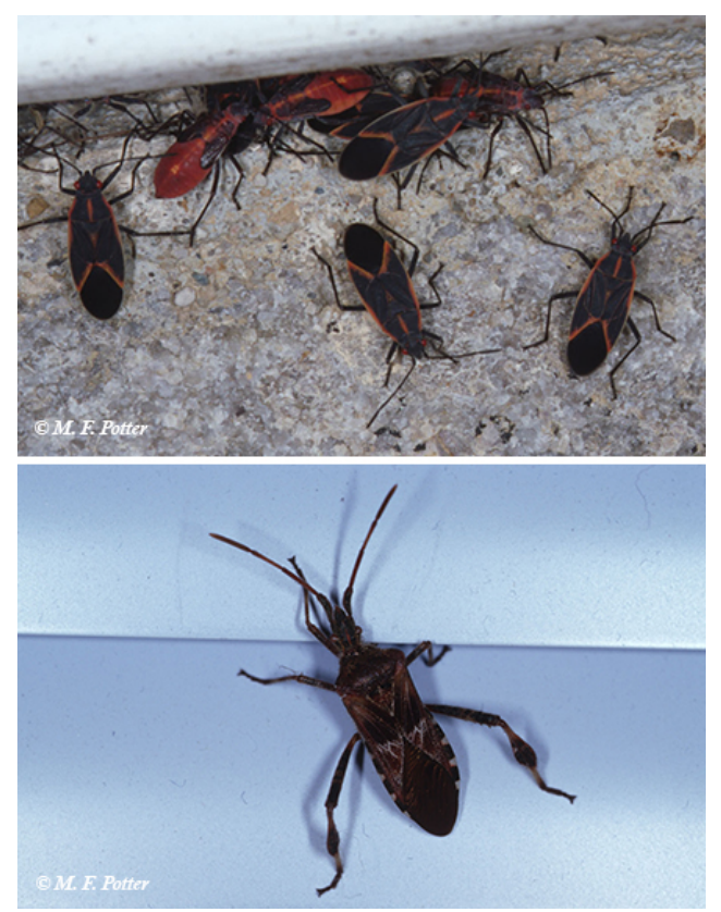
Boxelder bugs (top) and some leaf-footed bugs like the Western conifer seed bug (bottom) also enter buildings in the fall and are sometimes mistaken for stink bugs.

from other stink bugs by white and black banding on their legs, antennae, and around the edge of the abdomen. The term 'marmorated' means having a marbled or streaked appearance. If a number of stink bugs are appearing indoors, chances are that BMSB is the culprit. Confirmation is important, however, since it is easy to confuse them for other pests.