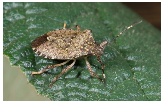
Adult brown marmorated stink bug. Note the light and dark banding on antennae, legs and abdomen

DESCRIPTION & HABITS. Stink bugs are related to bed bugs, but do not bite humans; their elongated, piercing mouthparts are used only to suck nutrients from plants. Their name comes from the pungent, cilantrolike odor produced by scent glands located on the midsection of the body.