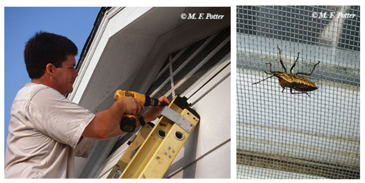
Attics are common entry points for stink bugs. Effective screening requires a mesh size no larger than 1/6-inch.

Traps. Pheromone-laced aggregation traps are being deployed for detection of BMSB and monitoring their levels in agriculture. Unfortunately, the same traps are ineffective at attracting stink bugs during their overwintering period within buildings. Similar to lady beetles, stink bugs are strongly attracted to ultraviolet light. Consequently, glue board-based light traps can be useful for harvesting these pests in areas such as attics. Householders can fashion their own stink bug trap by positioning a light above a large pan of soapy water.